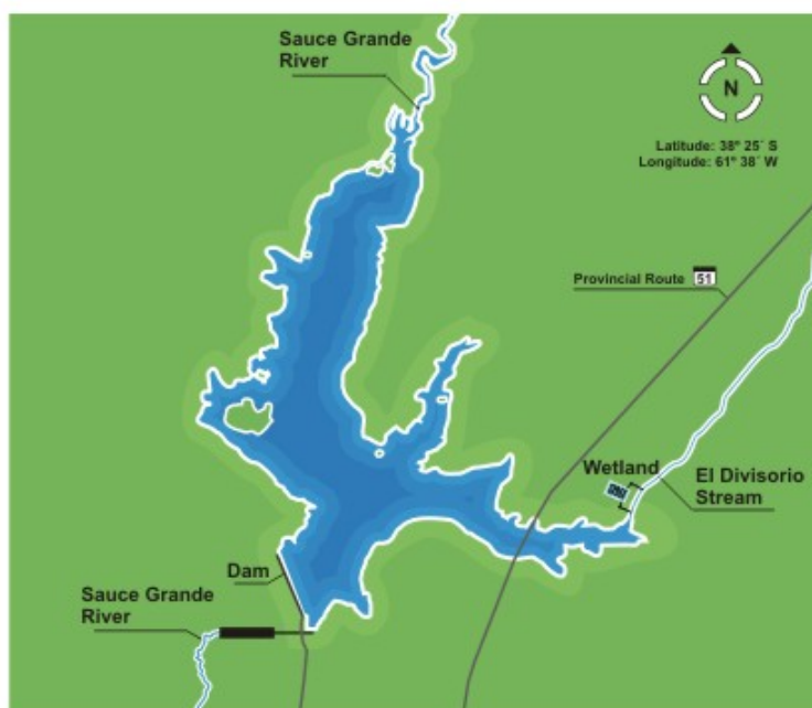
Fig. 1 Paso de las Piedras reservoir indicating the tributaries and the wetland position.