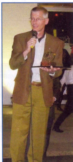
AMCA Award 2010 for International Researcher: Rainald Löhner

The ceremony of the AMCA Awards 2010 took place during the Congress Banquet of MECOM-CILAMCE 2010